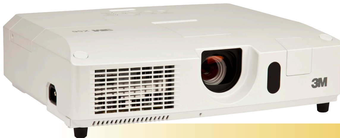
3M Digital Projector X56 78-9236-7730-2

With 5,000 lumens of brightness, extensive connectivity, horizontal/vertical lens shift and a x1.7 zoom lens, the 3M Digital Projector X56 is designed for even the most challenging installations. Stack two X56 projectors and get an incredible 10,000 lumens for ultra bright images. Network control and presenting facilities makes maintenance and broadcasting messages super easy. Up to 5,000 hours lamp life gives you low cost of ownership.