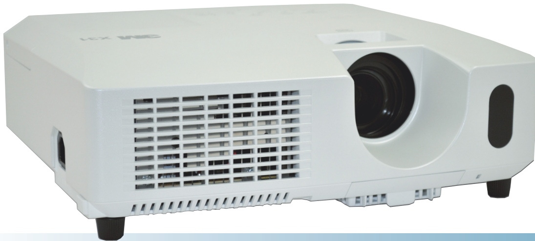
3M X46 Projector 78-9236-7725-2

The 3M Digital Projector X46 features 4,000 lumens of brightness and a 2000:1 contrast ratio for exceptional picture quality. Backed by the 3M brand for superior performance and reliability, the X46 features network functionality which allows effective management of assets to reduce cost of ownership, limit downtime and avoid unnecessary maintenance. Coupled with a new hybrid filter that operates for up to 4,000 hours under normal conditions the X46 is ideal for education and business organizations who are looking for minimal running costs over the lifetime of the projector.