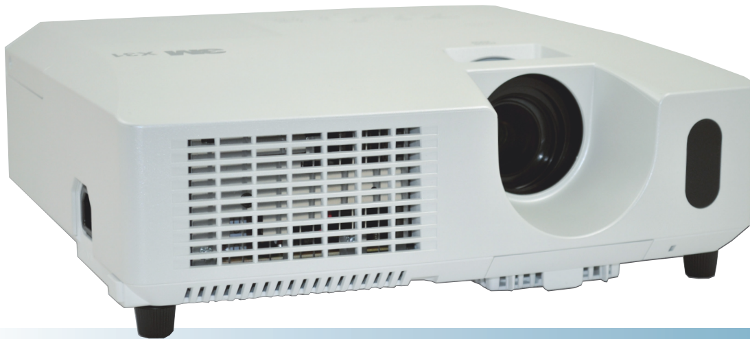
3M X46 Projector 78-9236-7725-2

The 3M Digital Projector X46 features 4,000 lumens of brightness and a 2000:1 contrast ratio for exceptional picture quality. Backed by the 3M brand for superior performance and reliability, the X46 features network functionality which allows effective management of assets to reduce cost of ownership, limit downtime and avoid unnecessary maintenance. Coupled with a new hybrid filter that operates for up to 4,000 hours under normal conditions the X46 is ideal for education and business organizations who are looking for minimal running costs over the lifetime of the projector.