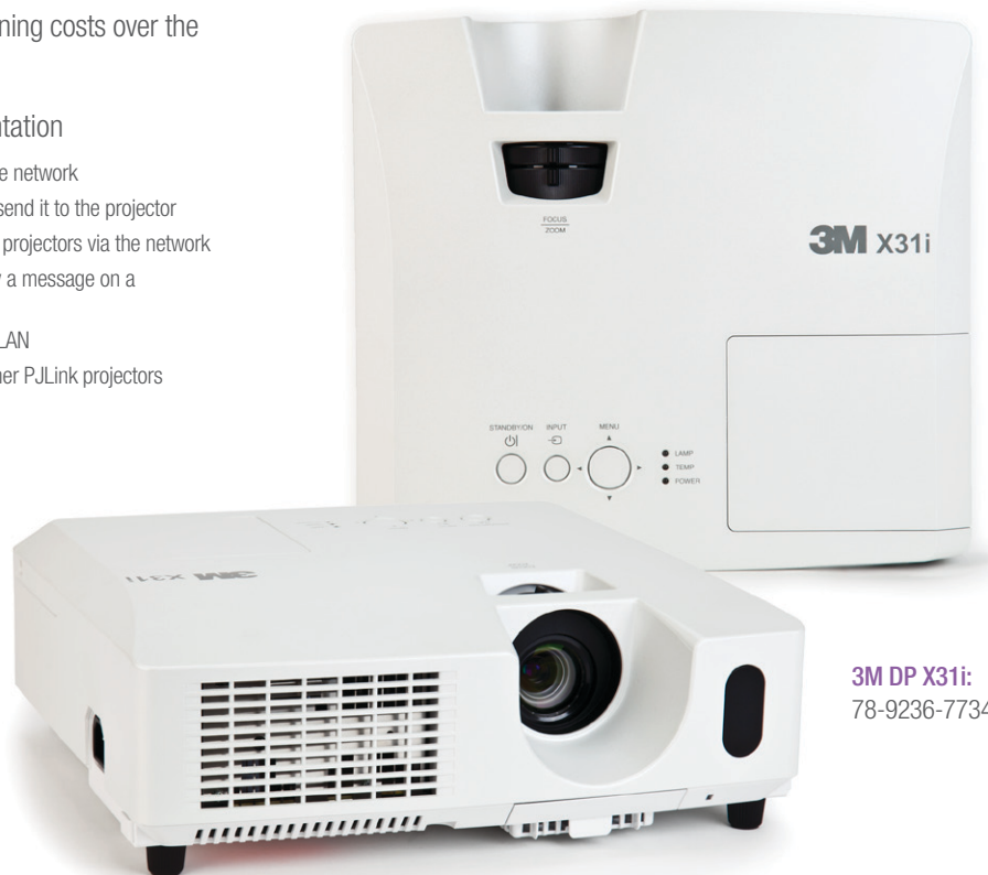
3M DP X31i: 78-9236-7734-4